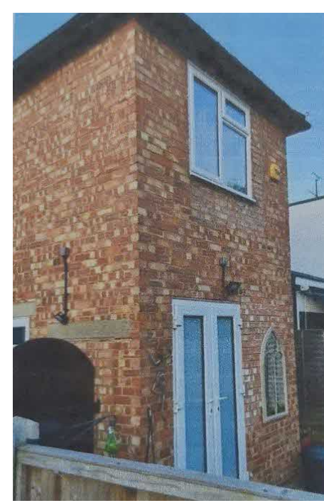
Photo 1 sent to planning officer on 27<sup>th</sup> April clearly showing non glazed door.

Photo 2 taken from applicants Surveyors report dated 11<sup>th</sup> May showing an old photograph has been used to give the impression the door is glazed.